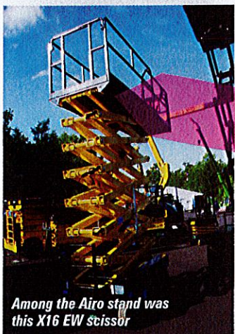
Among the Airo stand was this X16 EW scissor