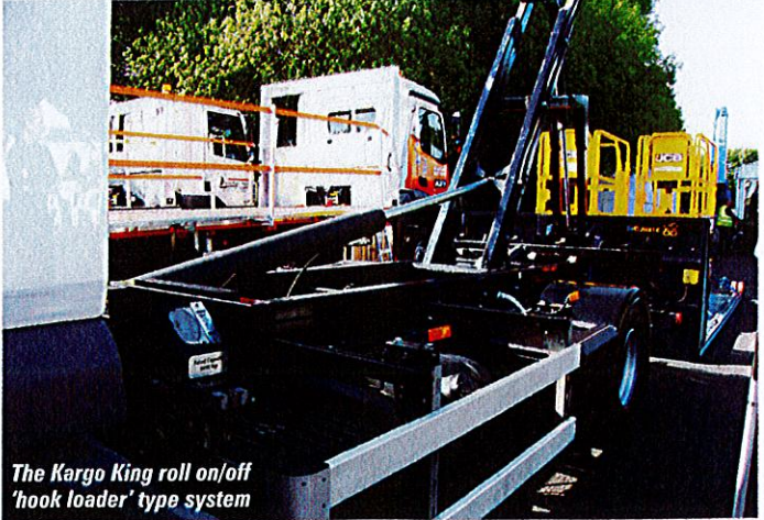
The Kargo King roll on/off 'hook loader' type system

Sterling showed the new Kargo King tilt bed, which uses a hook loader and flatbed body allowing equipment to be safely loaded and unloaded at ground level. The design uses a modified hook system which after the equipment is loaded and strapped to the flat bed body is then lifted onto the back of the 12 tonne chassis.