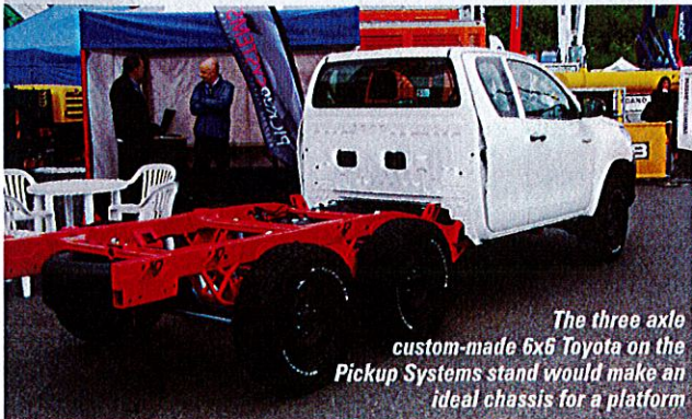
The three axle custom-made 6x6 Toyota on the Pickup Systems stand would make an ideal chassis for a platform

It demonstrated its Elevah and discussed new models planned for next year. It is also