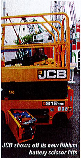
JCB shows off its new lithium battery scissor lifts

Adant Access - now owned by Skyking - will deliver a new 20 metre truck mounted Ryan Access in June, with a further four more this year. It had an extensive display with a focus on its lithium battery option slab scissor lifts.