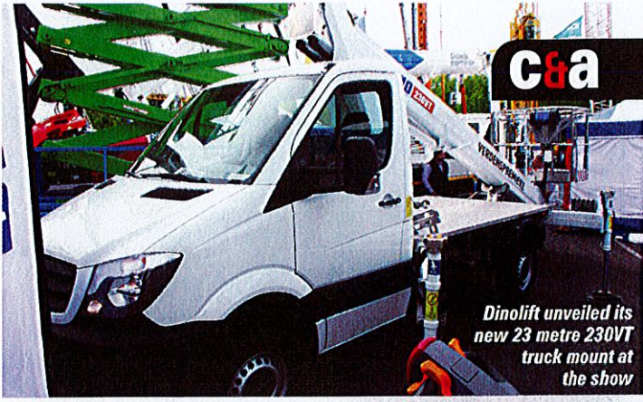
Dinolift unveiled its new 23 metre 230VT truck mount at the show