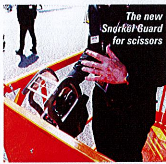
The new Snorkel Guard for scissors

Snorkel used Vertikal Days for the European launch of its new compact SR 626 telehandler and booked two orders at the show. It also unveiled its new Snorkel Guard for scissor lift, a protective cage around the fixed control box which stops upward movement when pressed. Now the distributor for Bluelift spider lifts it also sold a 31 metre spider lift to MBS and a Speed Level SL30 to CPH.