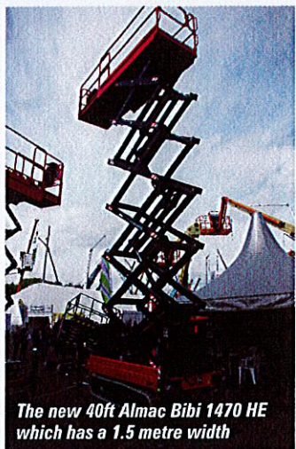
The new 40ft Almac Bibi 1470 HE which has a 1.5 metre width