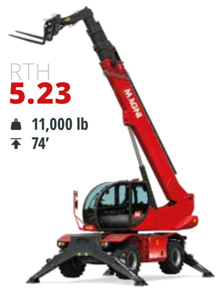
Deutz 100 kW (136 hp) @ 2,200 rpm