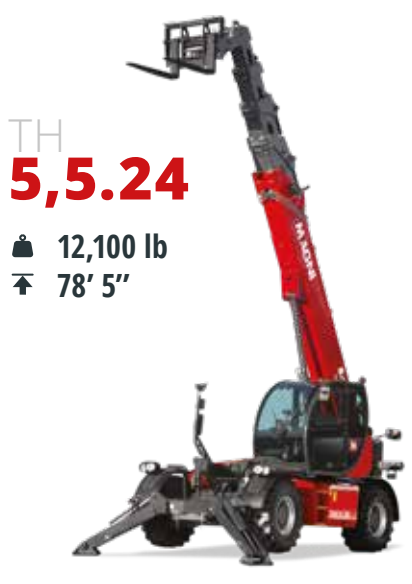
Deutz 100 kW (136 hp) @ 2,200 rpm