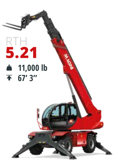
Deutz 100 kW (136 hp) @ 2,200 rpm