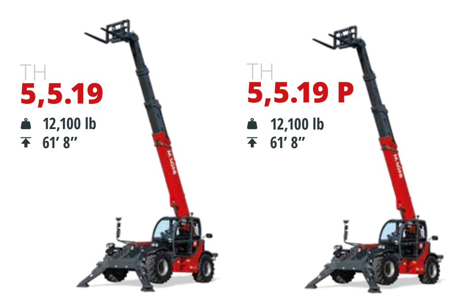
Deutz 74,4 kW (101,2 hp) @ 2,200 rpm