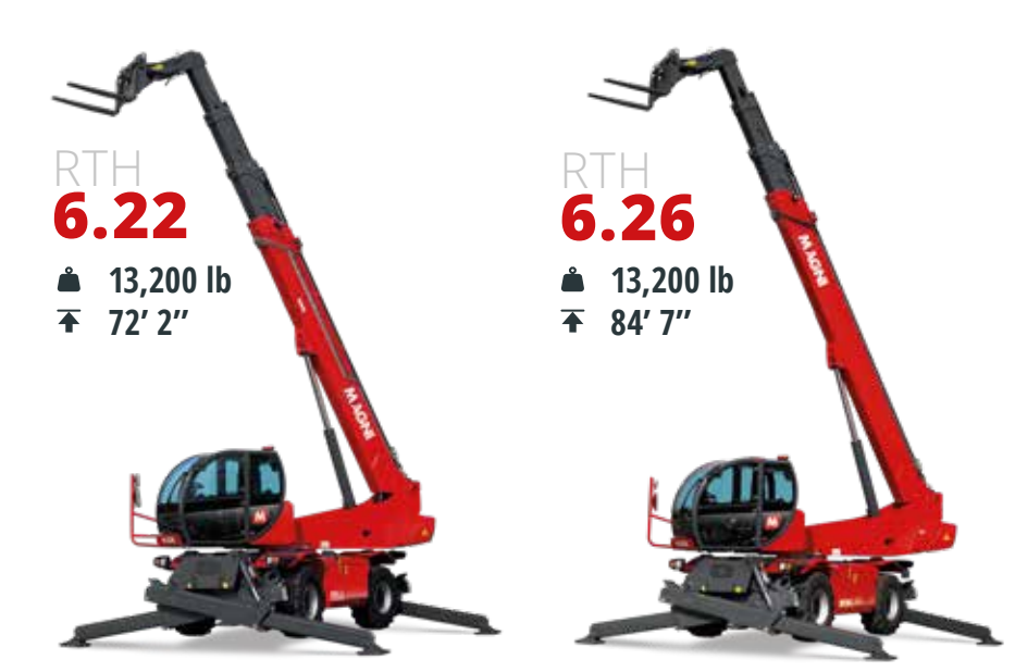
Deutz 100 kW (136 hp) @ 2,200 rpm