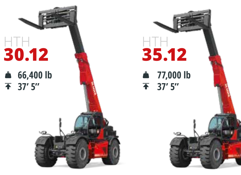
Volvo 175 kW (238 hp) @ 2,300 rpm