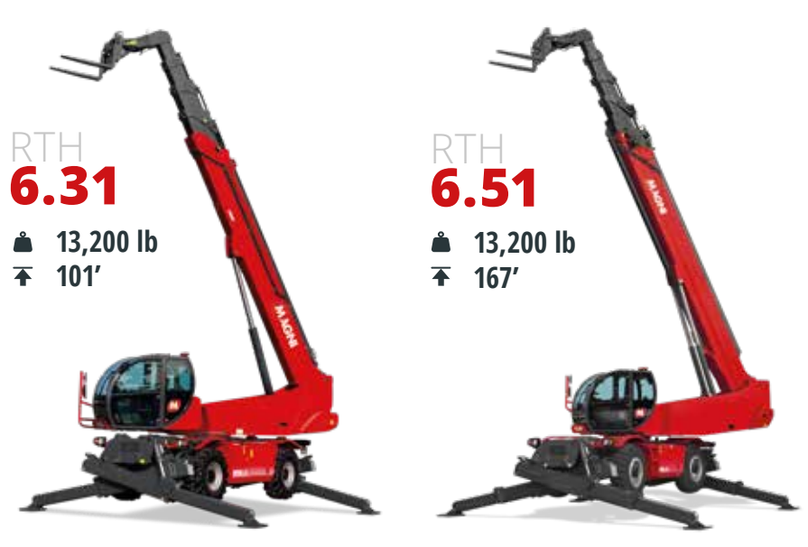
Volvo 160 kW (218 hp) @ 2,300 rpm