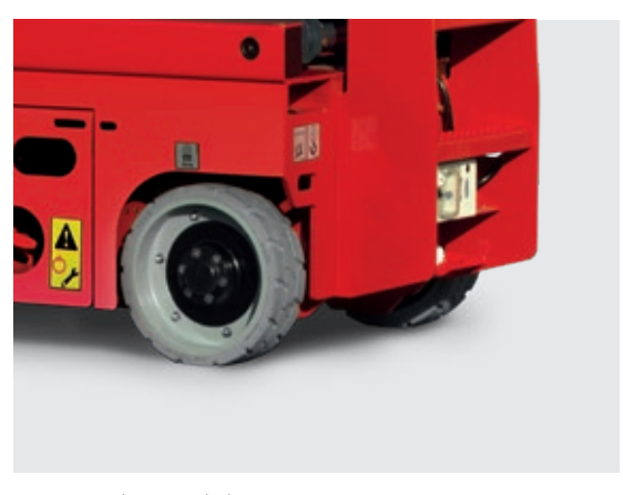
Non-marking solid tyres