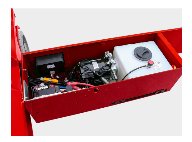
High efficienty pump system