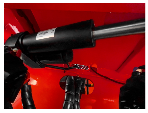
Electric actuator steerling system