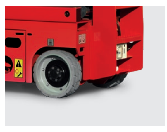
Non-marking solid tyres