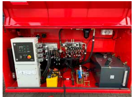
On-board diagnostic system