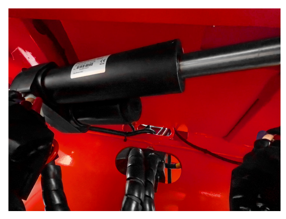
Electric actuator steerling system