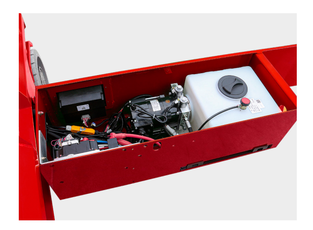
High efficienty pump system